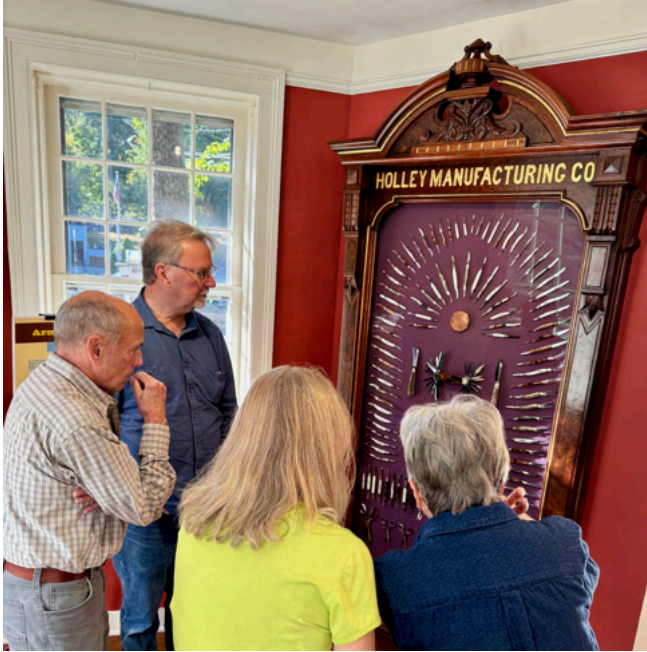
Exhibit Opening Reception