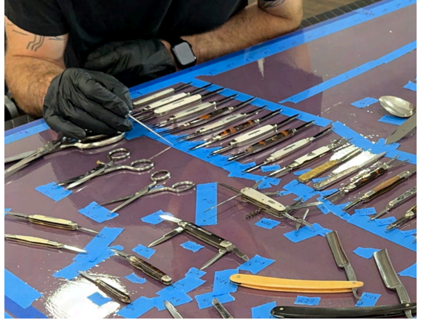
Assembling the Holley Knife Case