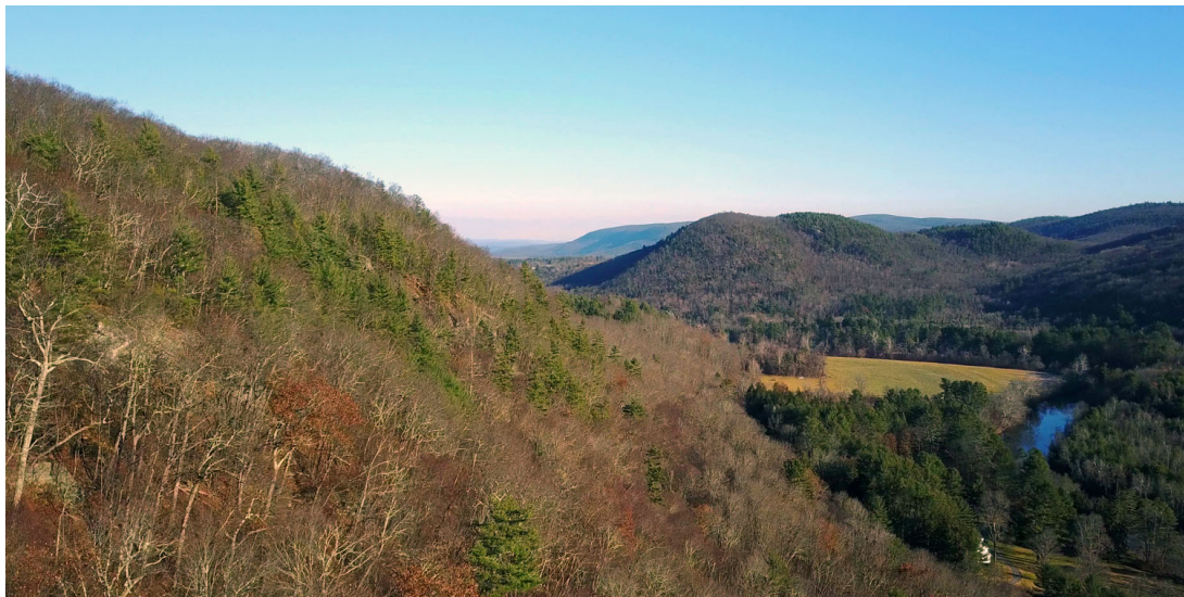
From the new Shostak Preserve, a beautiful view of the Land Trust's Sycamore Field and the Housatonic River.

A generous donation of 54 acres on Route 7 next to the Appalachian Trail has put the Salisbury Association Land Trust over the 3,000-acre mark for its preserved lands and conservation easements.