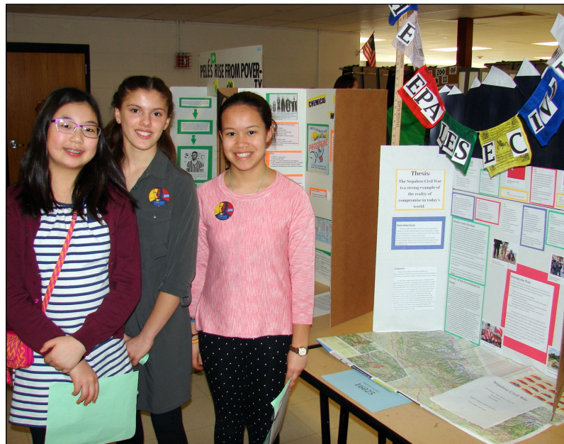
Three of the seventh grade students with their exhibit on the Nepalese Civil War.